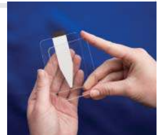
Bond the substrate to a mating substrate