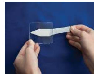
Pull the end-tab of tesa® Bond & Detach to release the bond