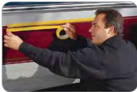
Creating long, straight paint lines is easy. 2