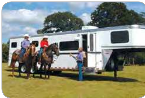
Ideal for paint bake operations. 3